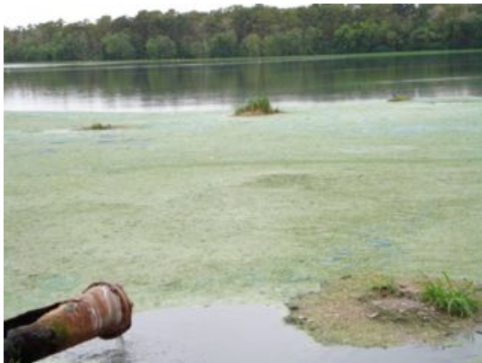
Figure 4 – Numerous sludge islands at the inlet of a 60 acre wastewater lagoon in southern Louisiana.

It has been found that the water movement along the bottom of the lagoon, developed by the single 2 HP “water moving” blower, develops enough water velocity to actually excavate large piles of sludge. In a 60 acre lagoon, located in south Louisiana, a trial was run to see if a number of “sludge islands” could actually be collapsed by a Lagoon Master Aerator. See Figures 4 and 5.