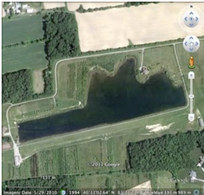
Figure 1 – An Ohio facultative lagoon that is short circuited at its western inlet and it has developed sludge buildup on all its northern banks, as well as most of its other banks.

Sludge buildup forces the water flow through the lagoon to “short-circuit,” or flow, more directly toward the outlet of the lagoon. This, of course, reduces wastewater residence time and shortens the effective life of a lagoon’s ability to meet state and/or federal effluent water quality requirements. See Figures 1 & 2.