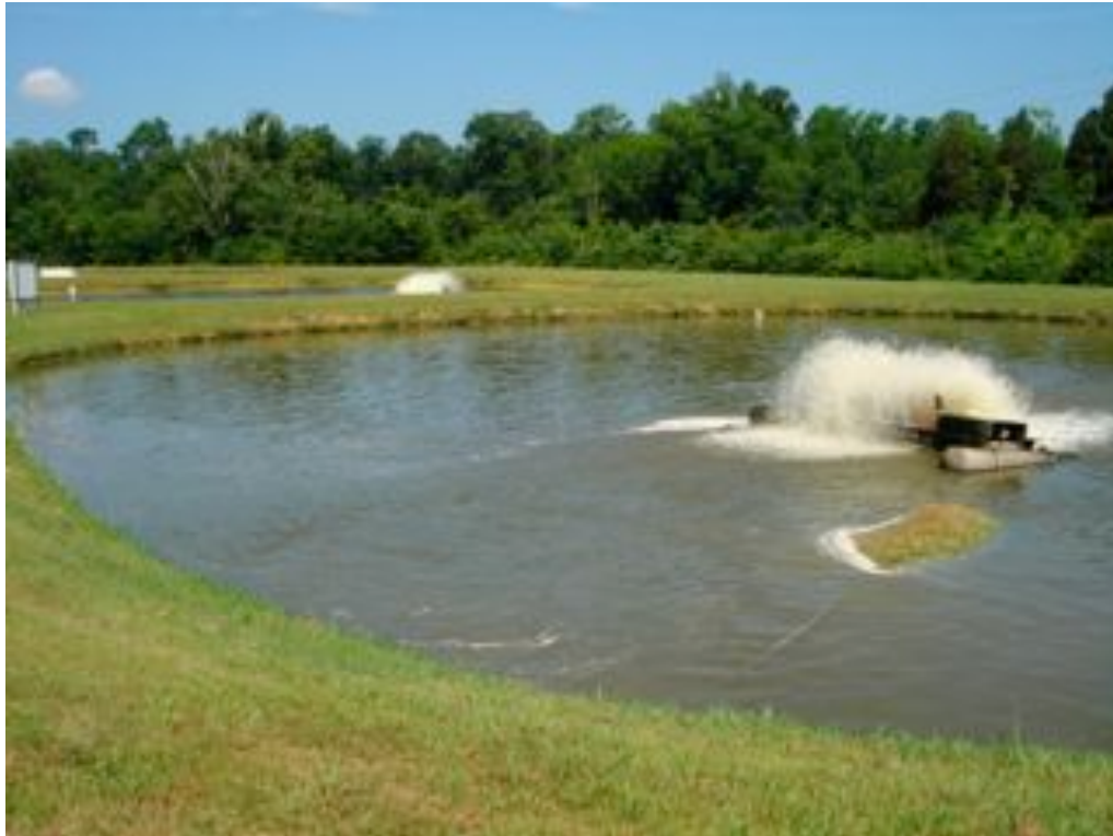
Figure 2 – An aerated wastewater lagoon where an island of sludge has been produced by the violent action of the nearby aerator.

In most rural communities that have used wastewater lagoons over the years, replacing them with on-line plants is seldom an option. Small towns do not commonly grow large enough to fund the high costs of modern activated sludge plants, or the personnel and equipment costs required to operate such plants. So, finding ways to lengthen the life of their wastewater lagoons, while meeting ever-increasing state and federal water quality standards, is a continuous effort.