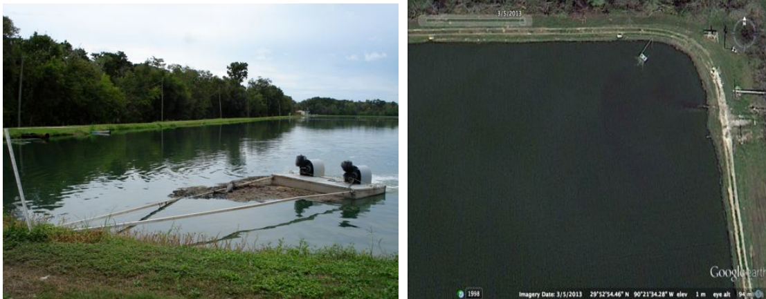
Figures 6 and 7 – (L) The Lagoon Master Aerator that has excavated all the sludge islands at the inlet of the 60 acre wastewater lagoon in southern Louisiana. (R) A satellite view of the same inlet lagoon corner with aerator in place. No islands exist in this photo. (Note: Yes that is an alligator sunning on the left stanchion of the aerator.)

At the time of installation of the Lagoon Master Aerator, it was “aimed” toward the islands. The developer of the aerator advises that this is the primary location of the first, or only, Lagoon Master – depending upon the size of the lagoon. This location of the first aerator, directly across the inlet flow of the lagoon, guarantees that the build up of sludge in that location will be moved into the rest of the lagoon and eliminate the possibility of short circuiting. Within 3 months following the installation of the aerator in the 60 acre test lagoon, the islands at the inlet of the lagoon disappeared. The continuous water flow at the bottom of the lagoon was strong enough to “chisel” away at the bottom of the inlet islands of sludge, thereby eventually collapsing them to be spread into other parts of the lagoon. See Figures 6 and 7.