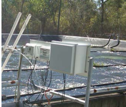
Reliant Sensor Cleaning